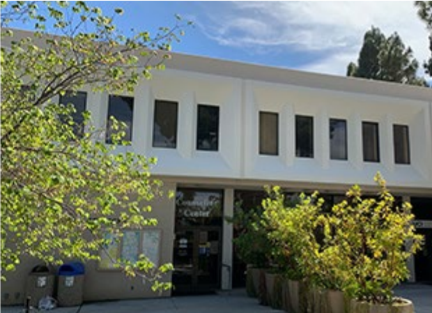
Students Services 1 Building before (left) and after (right) photos.